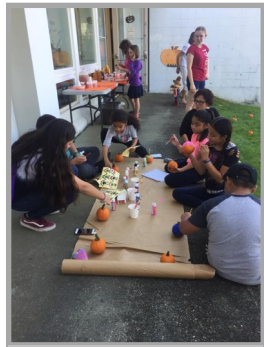
Kids enjoying our outdoor space.