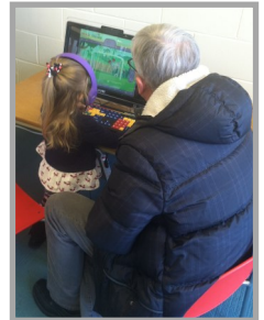
A young patron and her Pop Pop play on the Early Learning Station after Story Time.